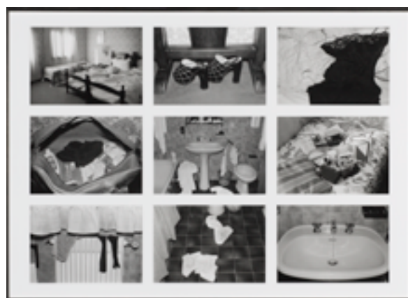
L'Hôtel , 1981-1983 (detail). 7 diptychs and a presentation text written by the artist. Chromogenic prints, gelatin silver prints. Centre Pompidou, Musée national d'art moderne, Paris