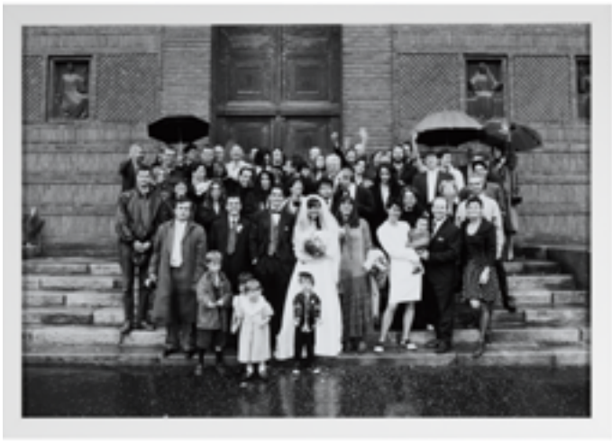
Les Autobiographies , 1995. Le Mari series (detail). 9 gelatin silver prints diptychs. Centre Pompidou, Musée national d'art moderne, Paris