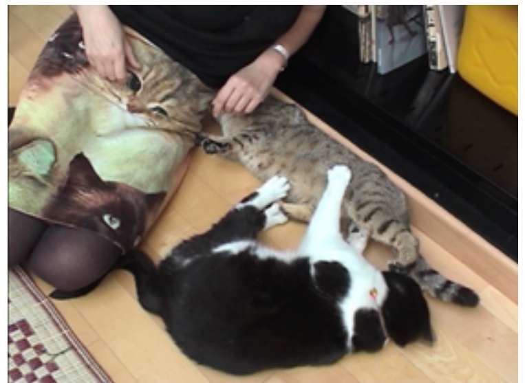
Souris Calle , 2018. Video HD, 4' 25". Courtesy Sophie Calle and Galerie Perrotin

Following the death of her cat Souris (that is translated as Mouse and Smile ), Sophie Calle made a series of works based on images of the feline. This video shows Souris playing among the stuffed animals that the artist collects in her house in Malakoff, near Paris. Sophie Calle recounts the seventeen years of life shared with her cat. She describes its personality, their habits and the void created by its passing. In a tragicomic style, the artist questions how she relates to the death of loved ones.