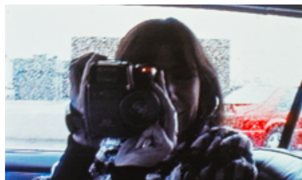
No Sex Last Night , 1995. 35 mm digitized film, colour, sound, 76 min. Centre Pompidou, Musée national d'art moderne, Paris