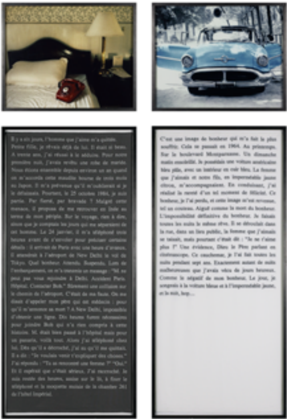
Douleur exquise , 1984-2003 (detail). 9 diptychs, embroidered texts on linen panels and photographs. Centre Pompidou, Musée national d'art moderne, Paris