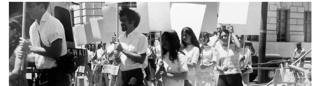
Anna Halprin, Blank Placard Dance, 1967